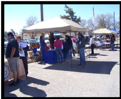
April 2012—Window Rock Judicial District Justice Day