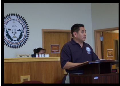
May 2012—To'hajilee Court Justice Day

Justice Days held at judicial districts.