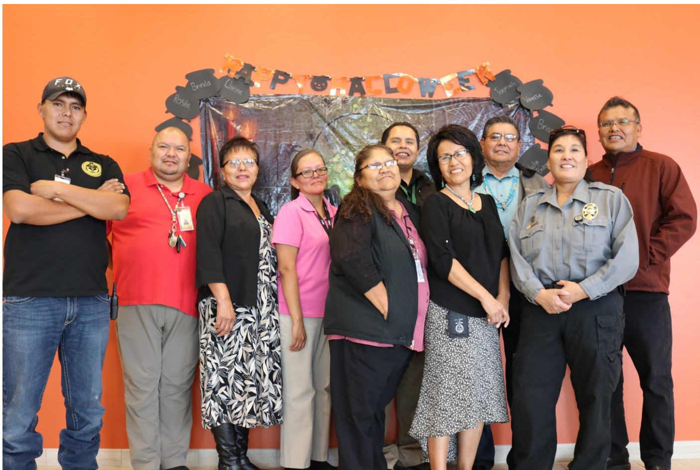
Chinle Judicial District Court staff at the Chinle justice center facility.

and other key personnel will be involved in implementing the components of the grant. Meetings with stakeholders have occurred and their input has been invaluable. Surveys were completed by youth using Survey Monkey (online survey). Information obtained from the survey will help determine the needs of the youth. The resource coordinator attended the Navajo Nation Youth Advisory Council work session at the Twin Arrows Resort and obtained valuable input from the youth who were in attendance. Work with the Chinle Juvenile Healing to Wellness Court is continuing.