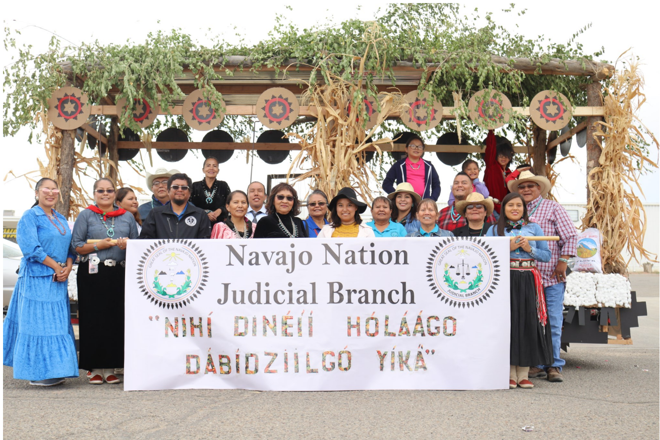
Participants of the Judicial Branch float during the Northern Navajo Nation Fair Parade on October 6, 2018.