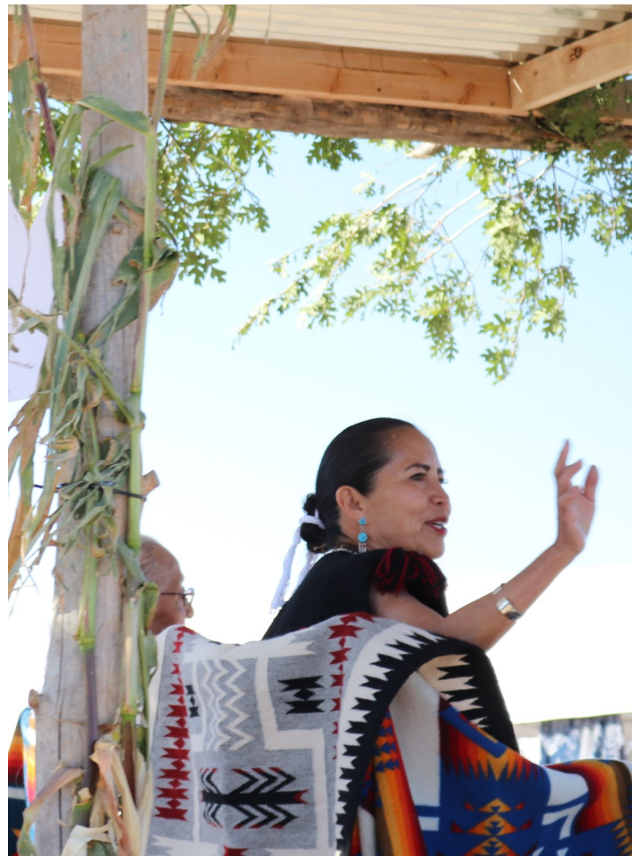
Chief Justice Jayne waves at people along the Navajo Nation Fair Parade route on September 8, 2018.