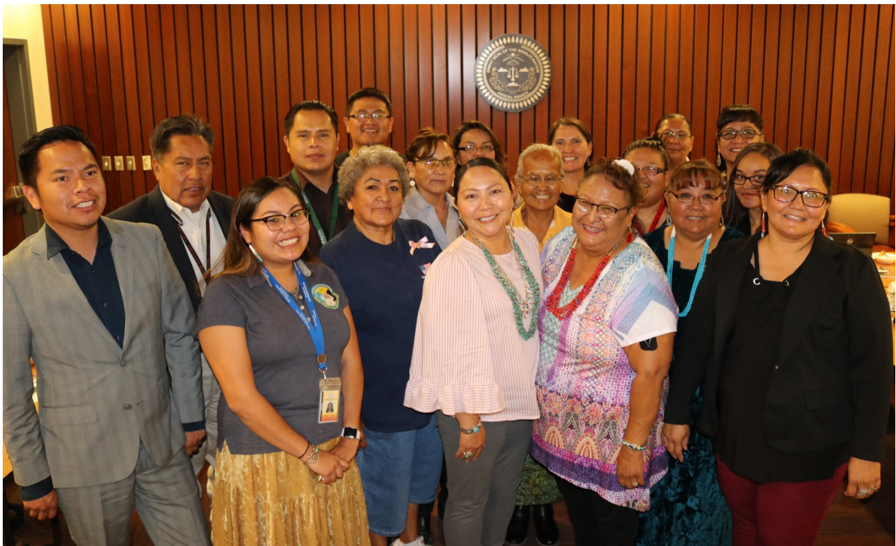
Save Our Schools: Juvenile Healing to Wellness Court partners during a meeting on September 20, 2018, at the Chinle Judicial District Court.

I have graduated from Fort Lewis College and continuing my education at Arizona State University. I have worked in the behavioral health field for five years as a case manager at Native American Connections and Aurora Behavioral Systems. I worked with adolescent and adults in both mental health and chemical dependency. The Juvenile Healing to Wellness Court is a program aimed at adolescent to young adults to reconnesct them with their native traditions through treatment and mentorship. The JHTWC works with various community resources to support youth sobriety, wellness and future autonomy. JHTWC uses two techniques—Indigenous Knowledge and Western Body of Knowledge—to help clients with sobriety. ●