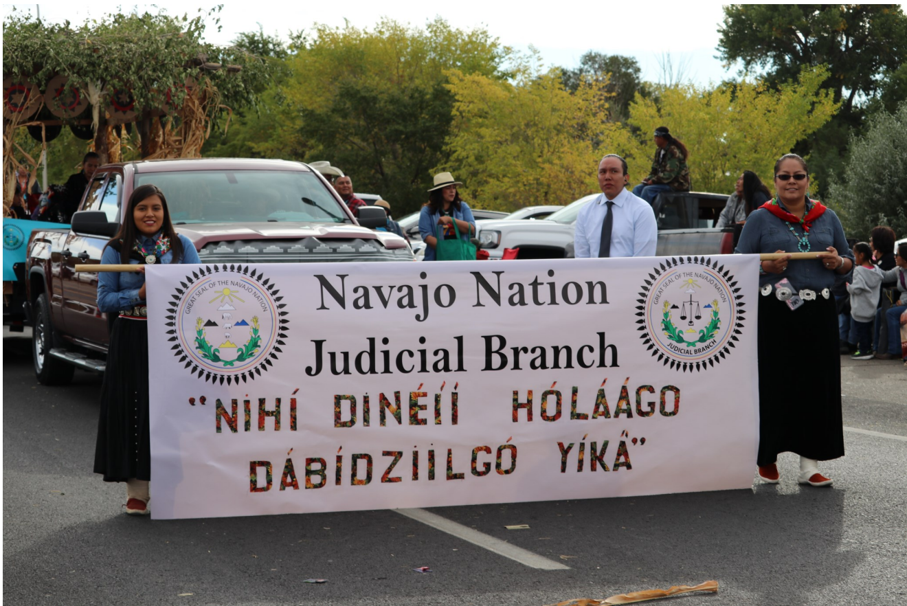
The banner for the Navajo Nation Judicial Branch float in the Northern Navajo Nation Fair Parade.