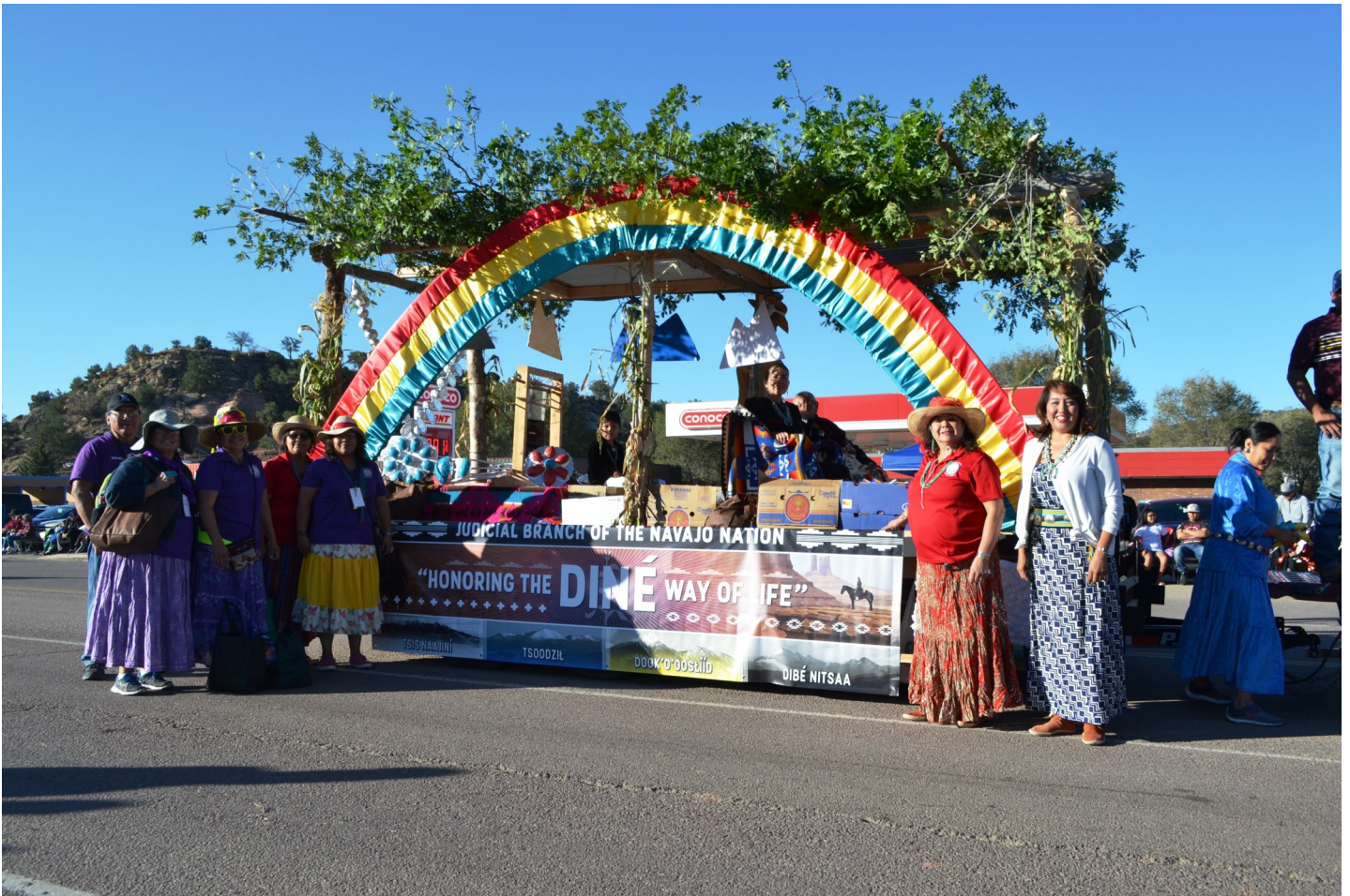
The Judicial Branch float at the beginning of the Navajo Nation Fair Parade on Saturday, September 8, 2018.