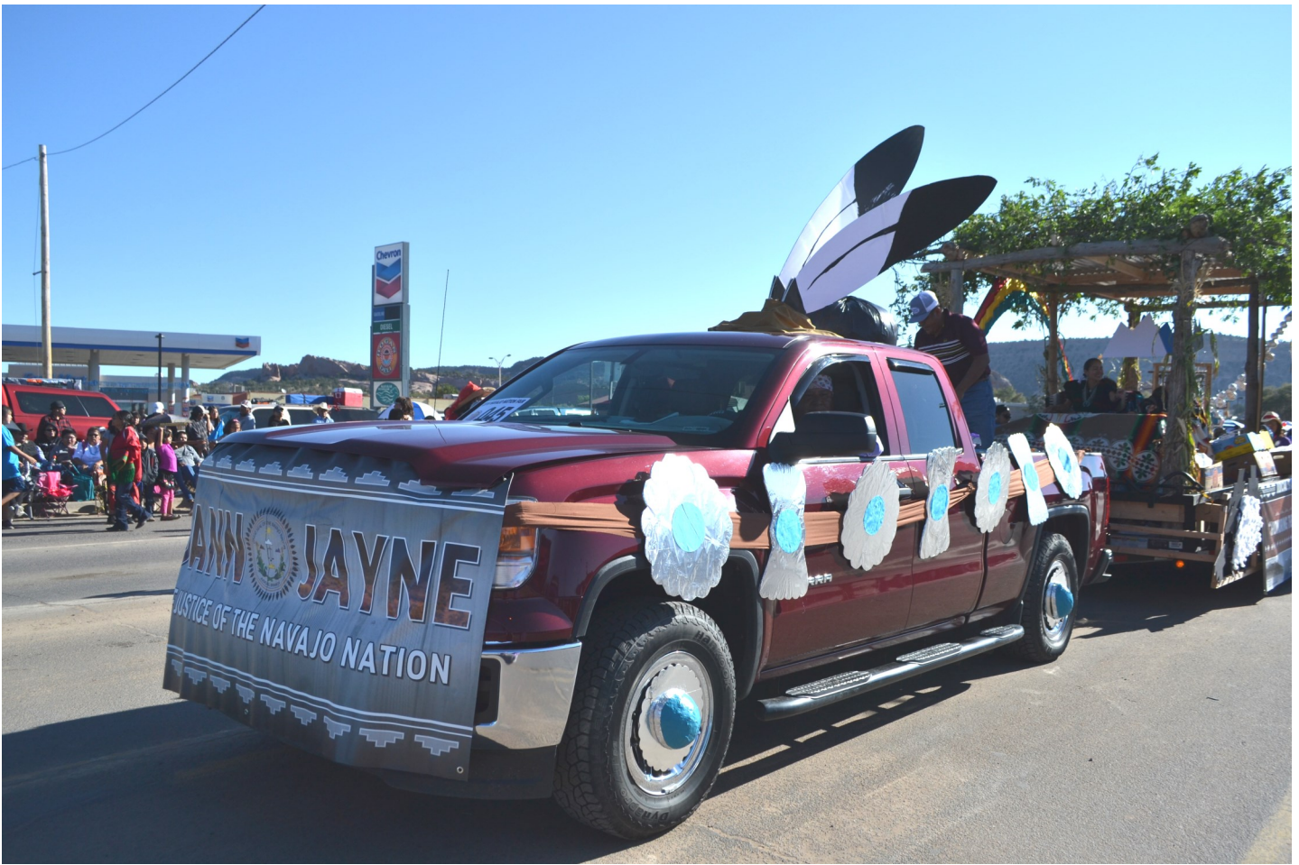
The Judicial Branch float makes it way through the Navajo Nation Fair Parade route.