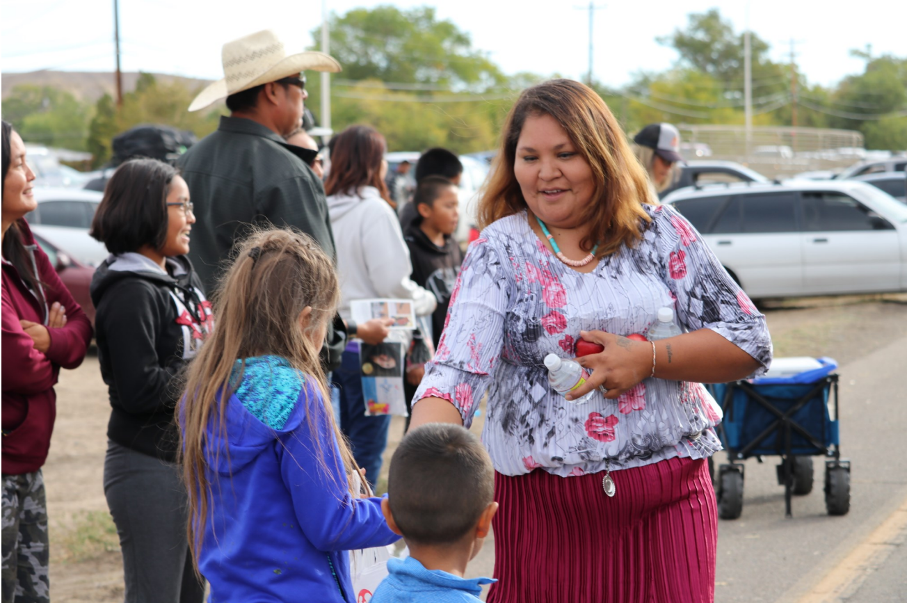
Handing out water and apples along the Northern Navajo Nation Fair Parade route.